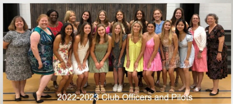
2022-2023 Club Officers and Pilots