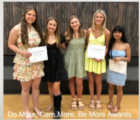
Do More, Care More, Be More Awards