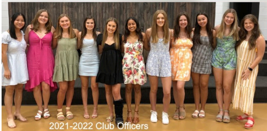
2021-2022 Club Officers