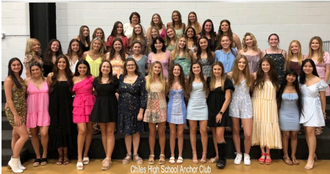
Chiles High School Anchor Club