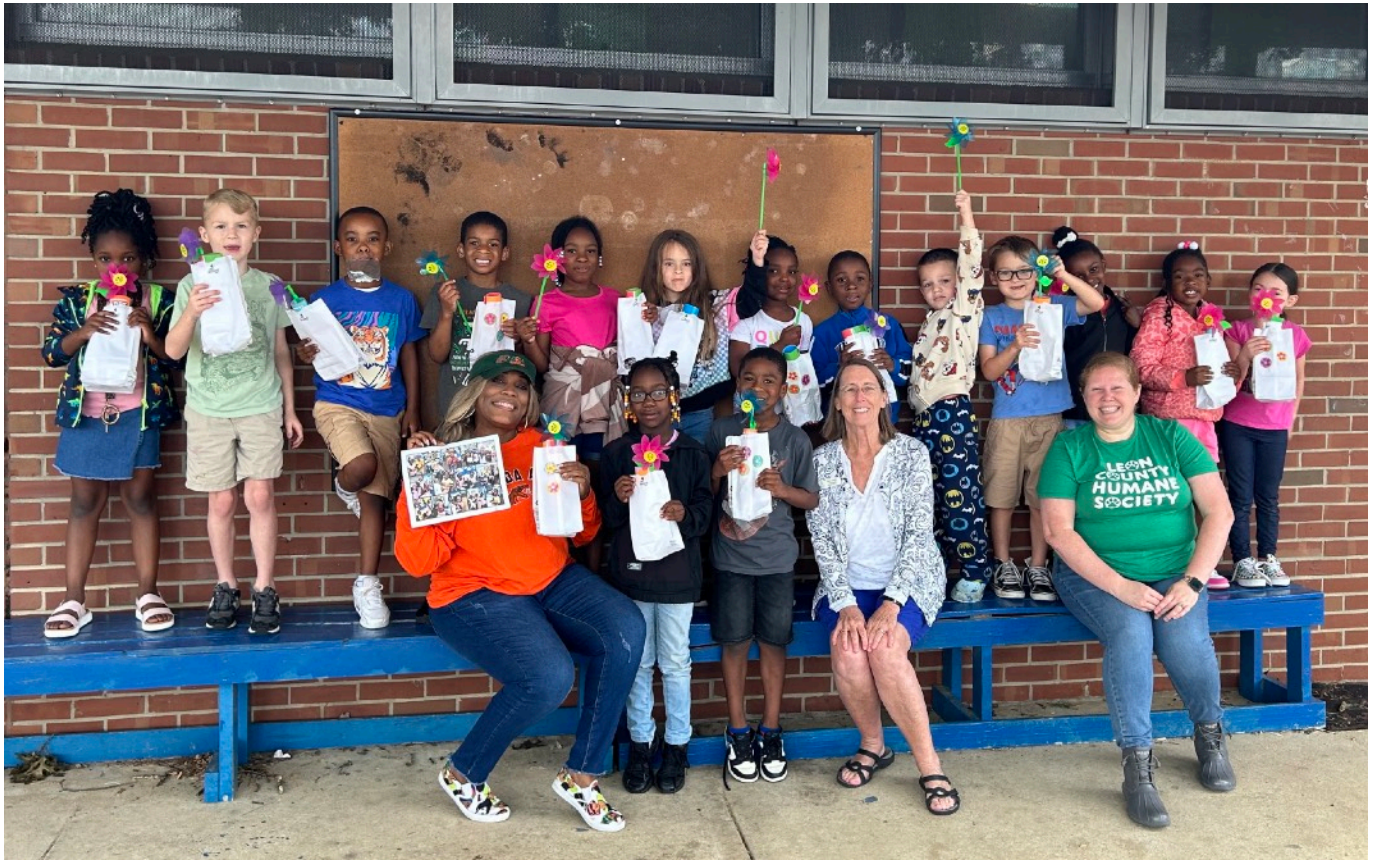
Classroom Connection - Playing with Play Doh and end of school party. The kids were a joy to work with this school year.