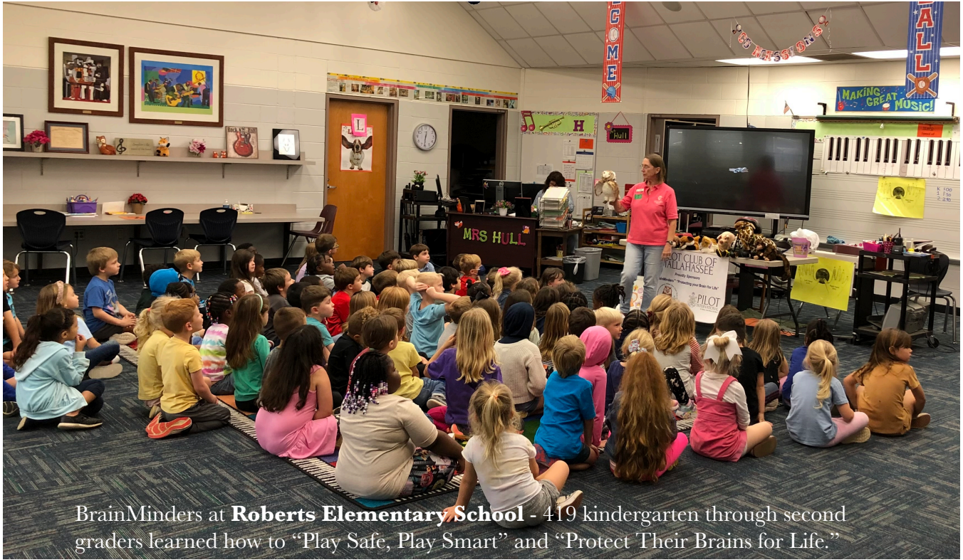
BrainMinders at Roberts Elementary School - 419 kindergarten through second graders learned how to “Play Safe, Play Smart” and “Protect Their Brains for Life.”

We played BrainO with the residents of St. Augustine Plantation, Assisted Living and Memory Support . They thanked us for being there and told us they liked playing the game. We'll go back in March.