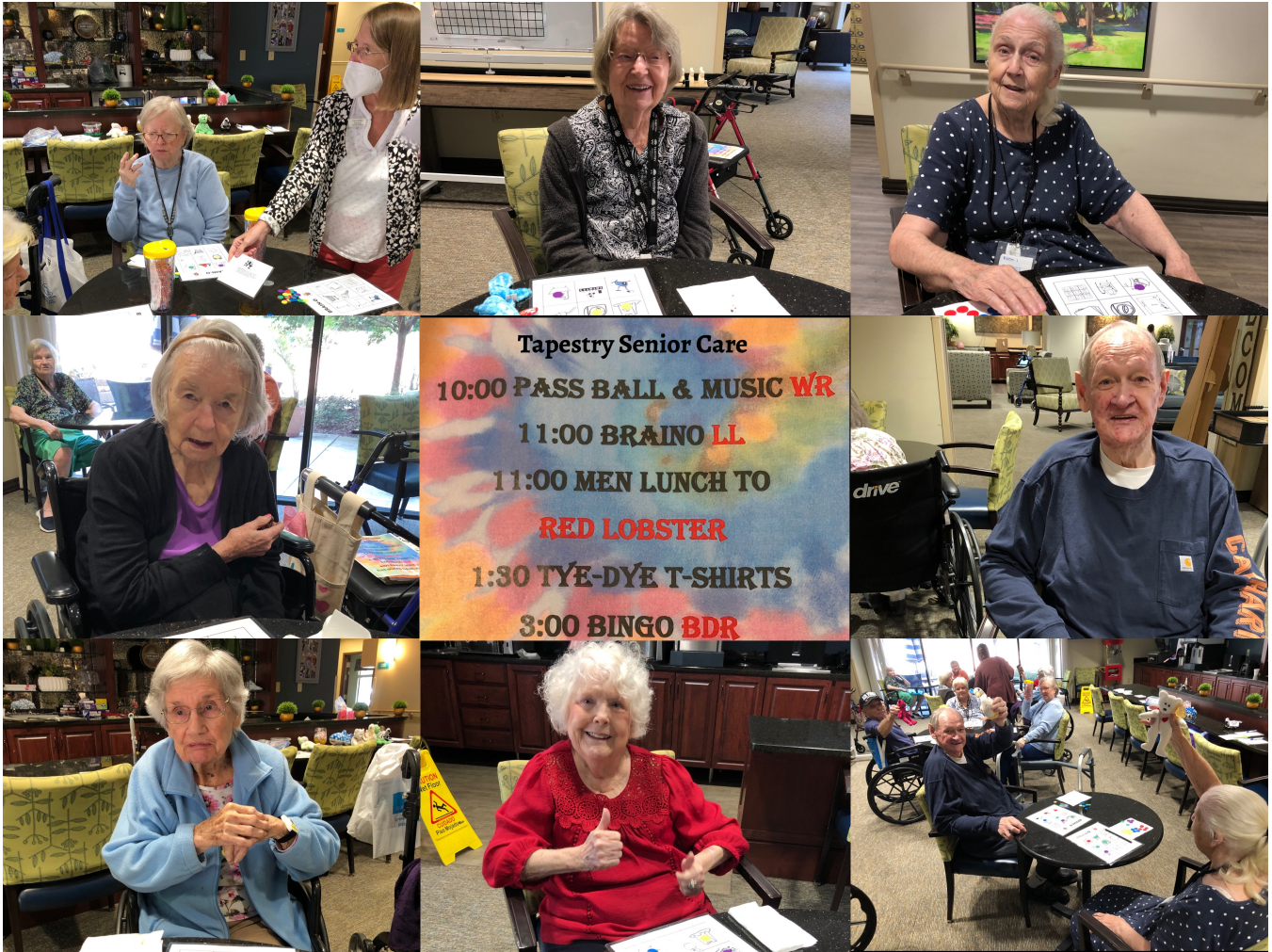
BrainO at Tapestry Senior Living