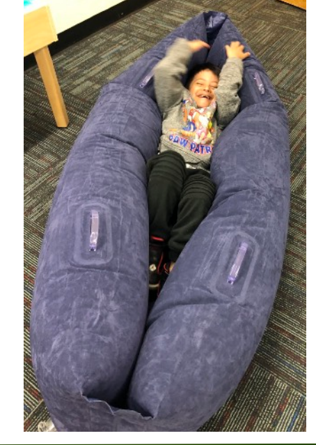
Sensory Canoe (air filled) for Fort Braden School